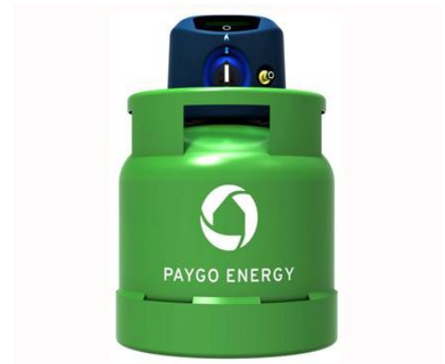
PayGo Energy- Kenya