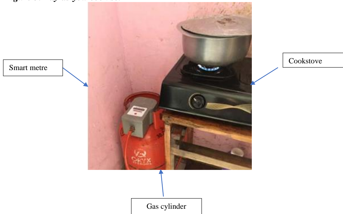
Figure 3: Pay-as-you-cook set

“...After my husband passed away, I could not afford to use gas anymore because it was too expensive for me. The cylinder remained empty for over two months, and the stove started rusting. After I joined KopaGas, things changed. Even with 5,000, I can buy gas. If I do not have any money, I can call my children and ask them to send me at least 5,000. It would not be easy for them to send me 50,000 at once for cylinder exchange, but 5,000 is manageable...”