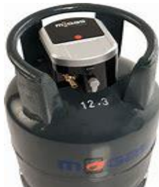
Mgas-Tanzania & Kenya